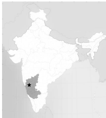
Figure 1. Map of India, indicating the location of Karnataka State and Hubli-Dharwad city (adapted from Wikipedia).